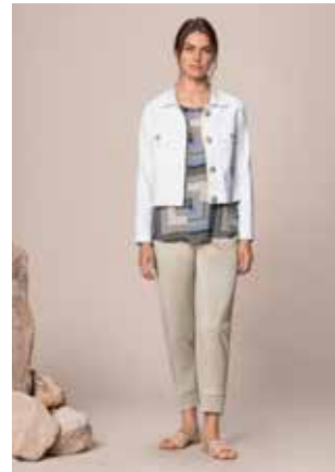
BLAZER 14049 COL.001 BLUSE 15030 COL.499 HOSE 10018 COL.179