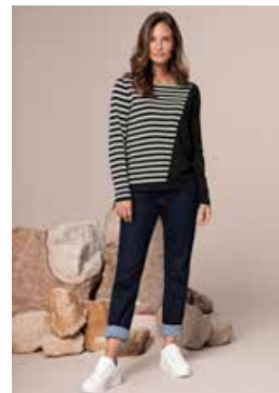
STRICK 18019 COL.484 HOSE 10801 COL.048