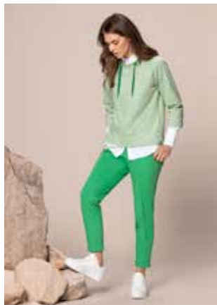
SHIRT 16000 COL.055 BLUSE 15007 COL.001 HOSE 10011 COL.055