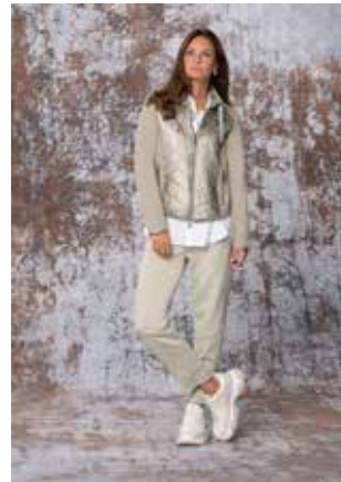
OUTDOOR 19000 COL.173 BLUSE 15007 COL.001 HOSE 10018 COL.179