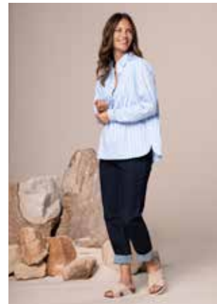
BLUSE 15004 COL.499 HOSE 10801 COL.048