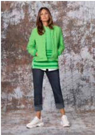
BLAZER 14004 COL.532 BLUSE 15007 COL.001 HOSE 10019 COL.048