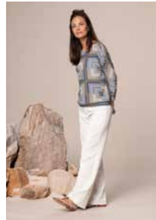
SHIRT 16018 COL.499 HOSE 10021 COL.119