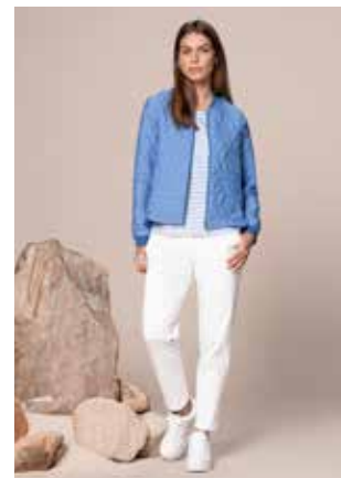
BLAZER 14004 COL.426 SHIRT 16117 COL.434 HOSE 10013 COL.006