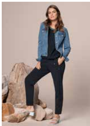
BLAZER 14040 COL.041 SHIRT 16116 COL.484 HOSE 10000 COL.484