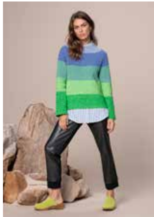
STRICK 18013 COL.599 BLUSE 15020 COL.499 HOSE 10007 COL.419