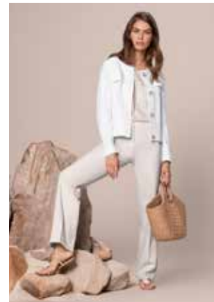
BLAZER 14038 COL.003 SHIRT 16150 COL.119 HOSE 10021 COL.119