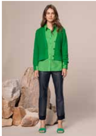
STRICK 18005 COL.055 BLUSE 15007 COL.532 HOSE 10007 COL.419