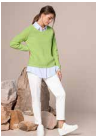
STRICK 18009 COL.528 BLUSE 15020 COL.499 HOSE 10013 COL.006