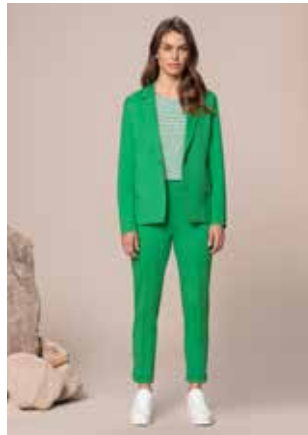
BLAZER 14022 COL.055 SHIRT 16191 COL.599 HOSE 10011 COL.055