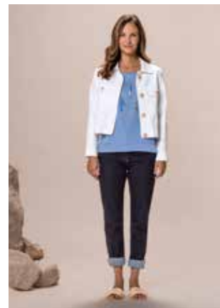
BLAZER 14049 COL.001 SHIRT 16113 COL.434 HOSE 10801 COL.048