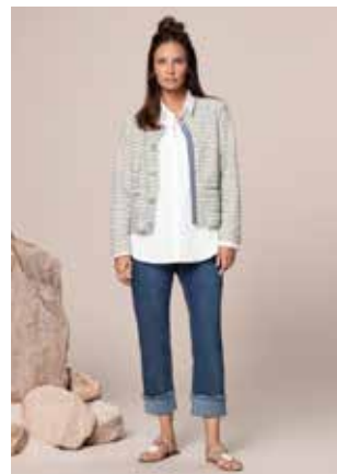
BLAZER 14016 COL.499 BLUSE 15007 COL.001 HOSE 10019 COL.048