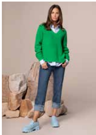
STRICK 18000 COL.055 BLUSE 15027 COL.499 HOSE 10019 COL.048