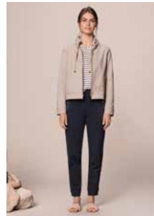
BLAZER 14024 COL.179 SHIRT 16010 COL.499 HOSE 10011 COL.484