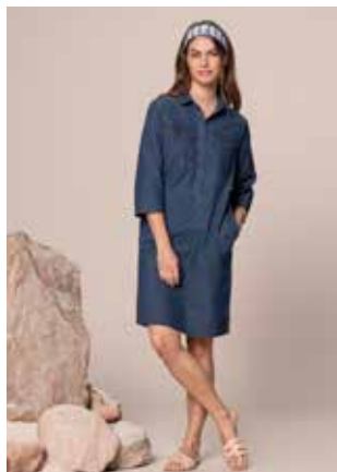
KLEID 17010 COL.048