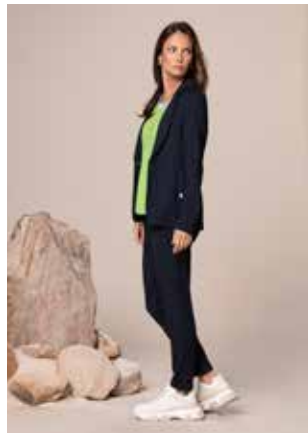
BLAZER 14022 COL.484 STRICK 18003 COL.533 HOSE 10011 COL.484