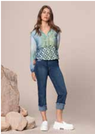
BLUSE 15017 COL.499 HOSE 10019 COL.048