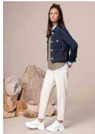
BLAZER 14046 COL.048 STRICK 18001 COL.180 BLUSE 15004 COL.499 HOSE 10000 COL.119