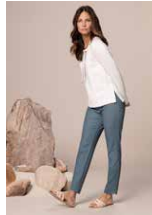
SHIRT 16025 COL.102 HOSE 10037 COL.499